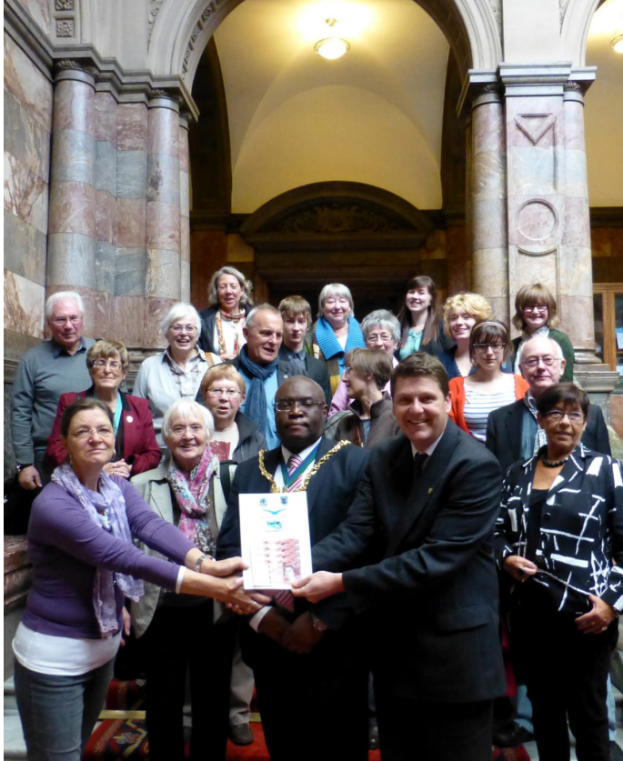
The Friends of Sheffield visit Sheffield Town Hall in September 2012

Recurring activities organised by the Friends of Sheffield include joint activities, club evenings and cultural events. Anyone interested is cordially invited to take part in the activities and support the German-British friendship.