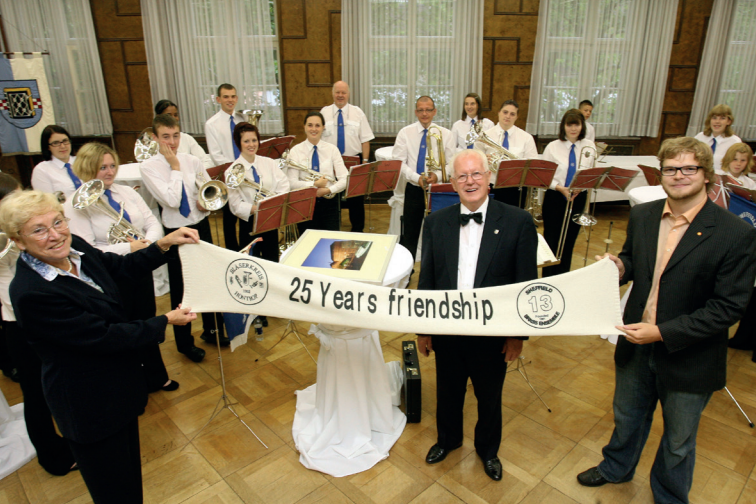
Sheffield Brass Ensemble and Bläserkreis Höntrop: 25 years of friendship