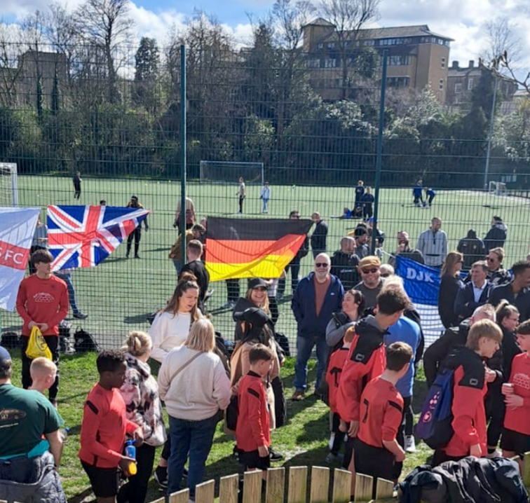
DJK Adler Riemke in 2024 in Sheffield

resumed in 2023. This year, the 32nd official meeting between the two clubs took place at Easter.