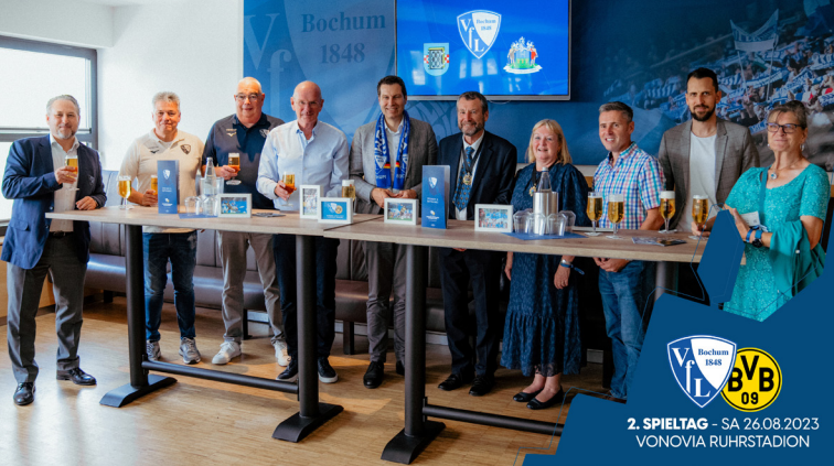
Stadium visit on the occasion of the delegation visit of Lord Mayor Colin Ross to the Music Summer 2023

Sheffield proved to be a suitable and, above all, reliable partner with an equally great tradition in steel production and processing at the time. For decades, the most extensive exchange of visits took place here at various levels, particularly focussing on young people.