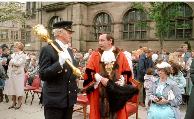
Lord Mayors Parade 1986

Norton Parkway in Sheffield is renamed the 'Bochum Parkway' – based on the Bochum Sheffield ring road.